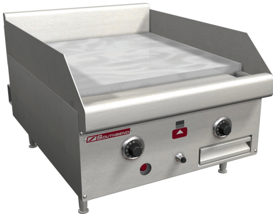
Model shown Model HDG-24