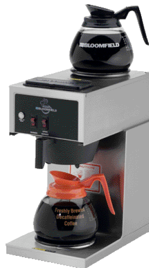
8543-D2 with optional decanter

If you're looking for rich, flavorful coffee but are tight on counter space, plug in the Bloomfield Lo-Profile® Pour-Over brewing system. At a little under 17" tall, it's short in stature, but long on features. Like all Bloomfield products, this proven, efficient brewing system is designed to take advantage of the finest electrical components and has the lowest service cost in the industry for this type of brewer. Our exclusive water delivery system spreads a precise amount of water over the coffee grounds for complete saturation and much better taste.