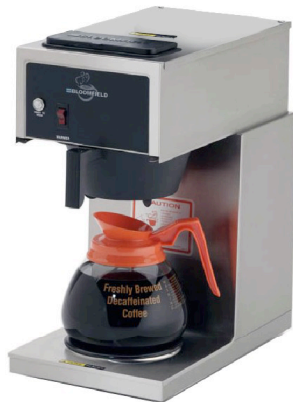
8542-D1 with optional decanter

8543-D2 Koffee King® Two Warmer In-Line Pour-Over, Lo-Profile® Coffee Brewer