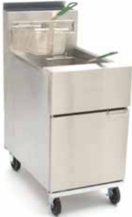
SR62G Shown with optional casters.